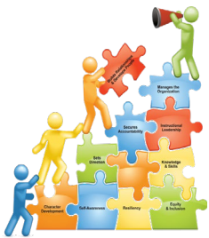
Coaching and Advisory Sessions

Talent Development has different faces. What strategies work for you and Why?